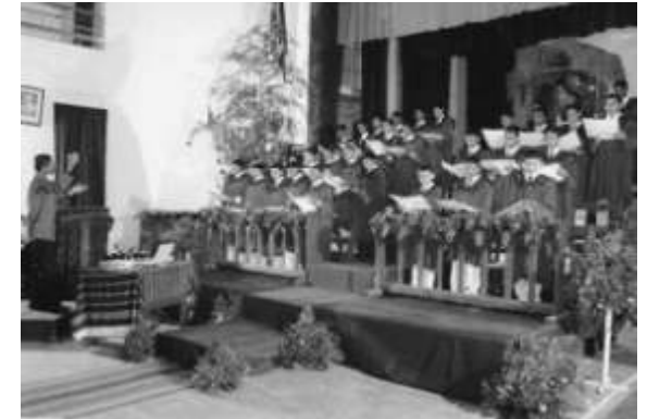
Choristers with new robes for the Carol Service