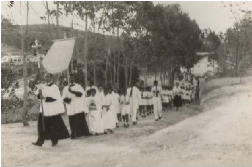
Procession leading towards the new chapel