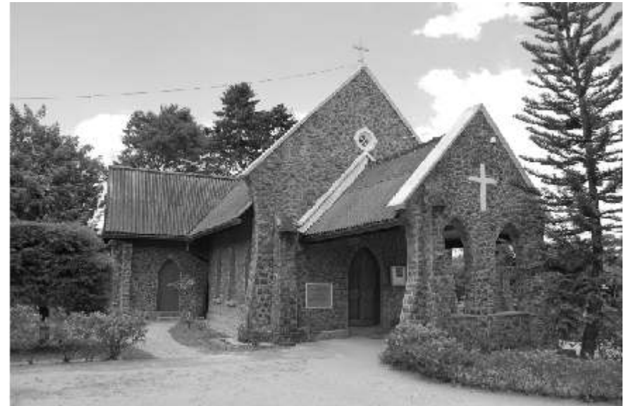
The Facade of the Chapel of the Good Shepherd