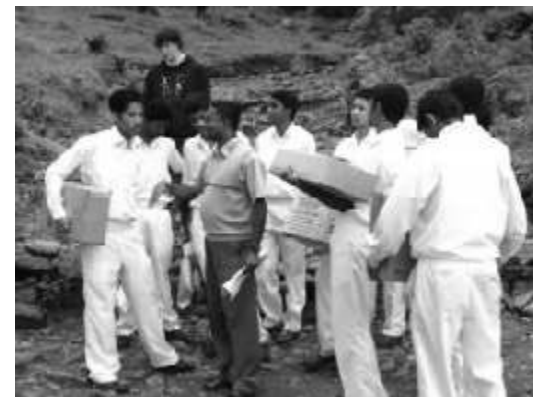
Charity work by the Student Christian Movement