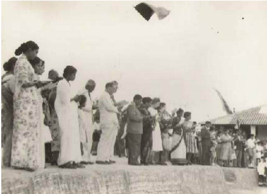
Staff and well-wishers at the ceremony of the laying of the foundation stone