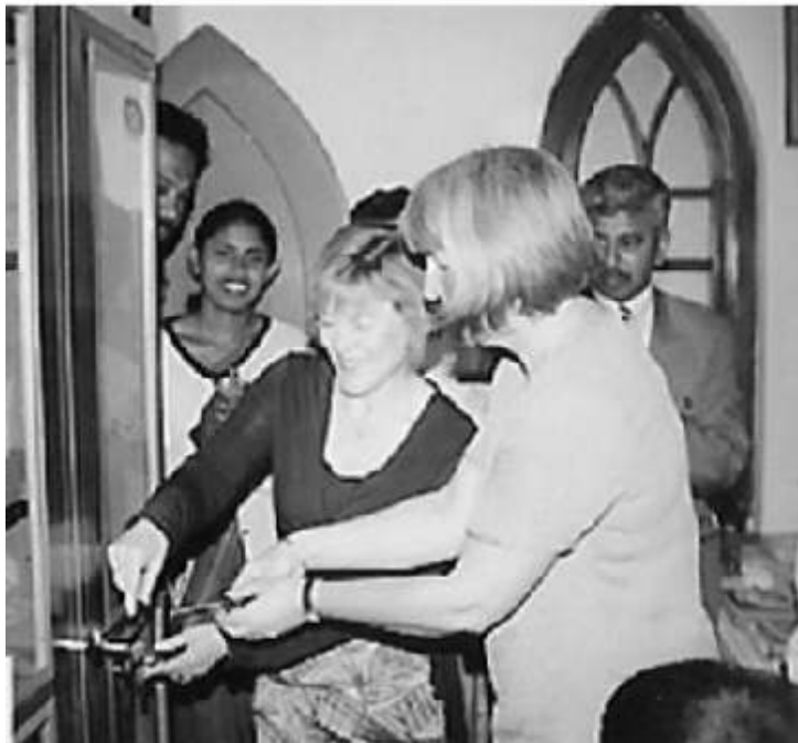
Opening of the Chapel Library by the Staff of Richard Taylor Primary School UK.