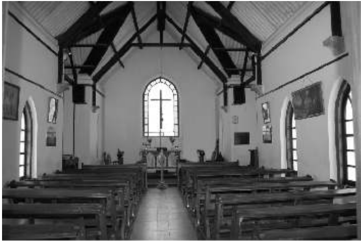
Interior of the Chapel of the Good Shepherd